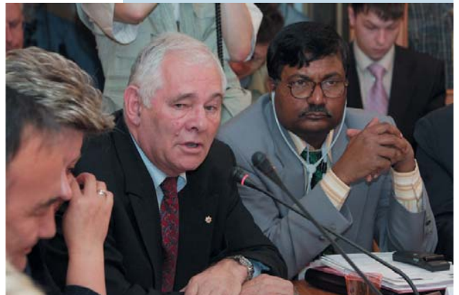
Doctor L.Roshal, chair of Committee on Healthcare Issues, Russia's Public Chamber