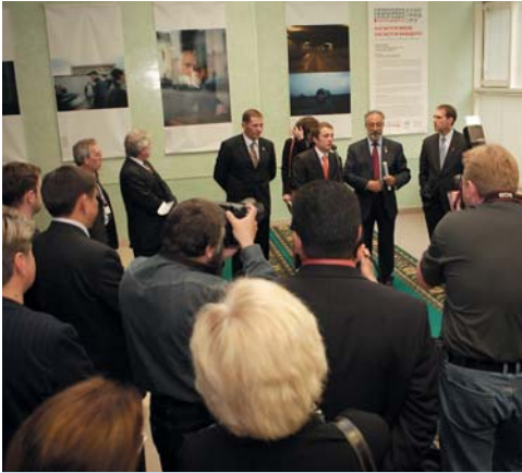
At the first international parliamentary conference on HIV/AIDS in Eurasia and the Role of the G8: opening ceremony of the new photo exhibition "Affects Me. Affects Everyone," held in conjunction with the conference by the Russian Media Partnership to Combat HIV/AIDS and Transatlantic Partners Against AIDS (TPAA), together with the Community of People Living with HIV/AIDS (PLWHA) and the Objective Reality Foundation. This photo project features portraits of policy leaders, prominent public figures, artists, performers, journalists, managers from middle to top level and many others accompanied by personal expressions of participants' attitude towards the issue of HIV/AIDS (State Duma, 8 June 2006)