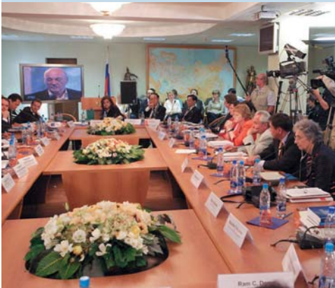
At the first international parliamentary conference on HIV/AIDS in Eurasia and the Role of the G8: During the conference, participants connected to a live broadcast of the talk show, "Time to Live," hosted by Vladimir Pozner, a leading Russian television journalist and TPAA Board member, and held in Saint Petersburg. Conference participants answered questions posed by members of the studio audience via a live satellite feed. The live telecast provided the conference participants with an opportunity to update the public at-large on the agreements reached during the conference. The telecast was organized by Fund for Social Development and Information within the frameworks of GLOBUS project and Saint-Petersburg STO TV-channel (State Duma, 8 June 2006)